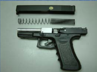
30X after disassembling the slide