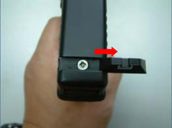
Remove the rear sight and remove the screw