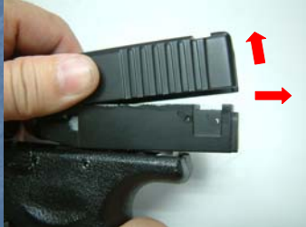
Pull the slide backward and lift it up