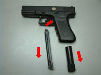
Un-install the magazine and Cylinder cover