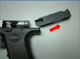
Remove the Re-cock cover